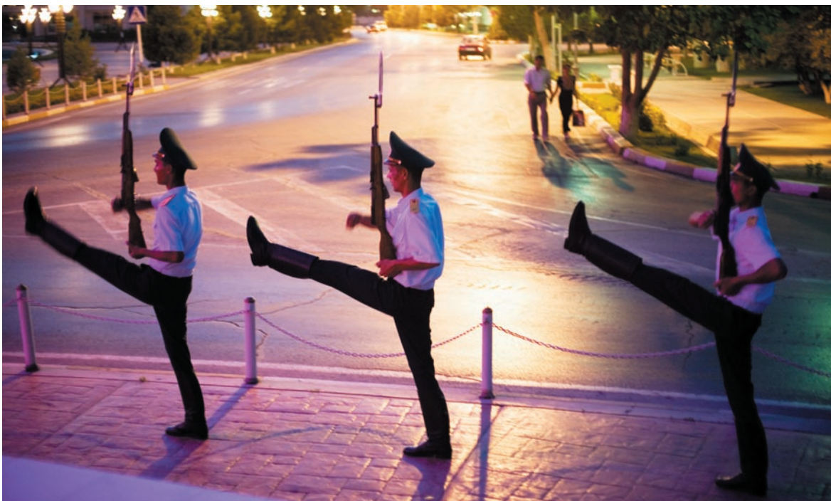
Turkmenistan is a dictatorship of the worst kind, ranked alongside Burma and North Korea. 1