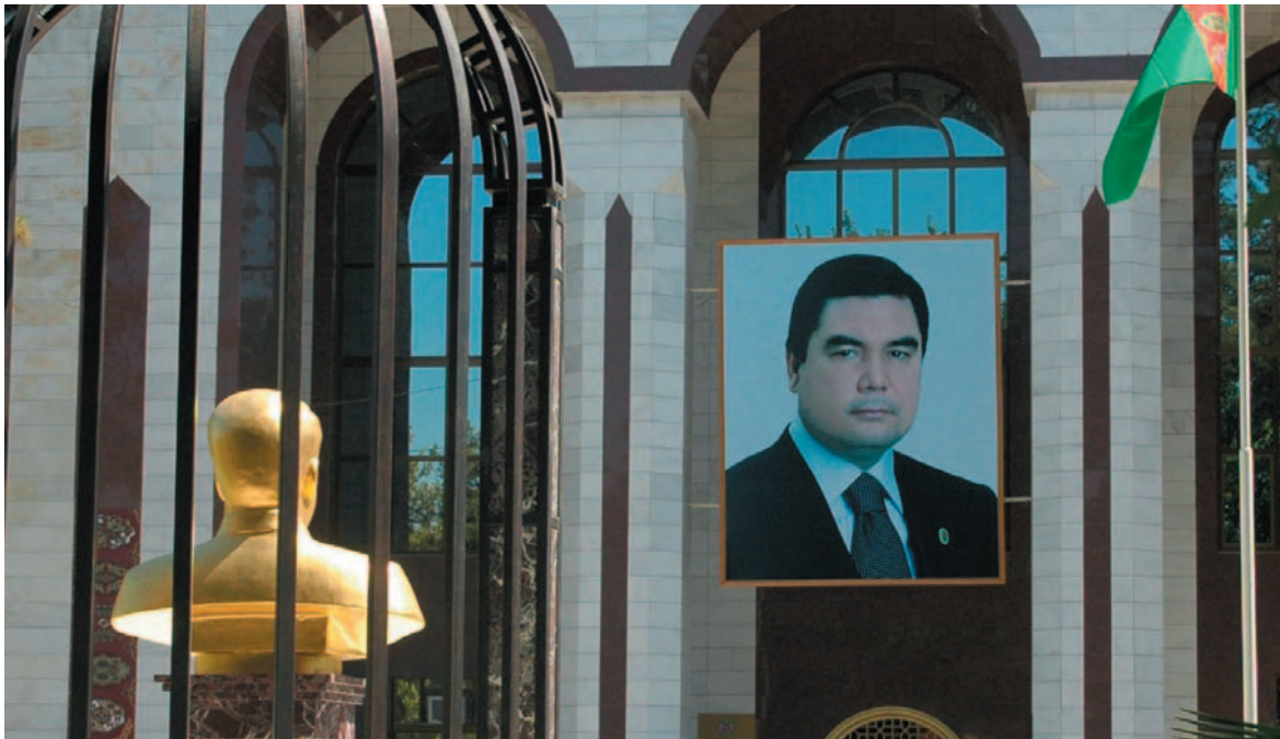
A new personality cult emerges: A picture of Turkmen president Berdimukhamedov faces a bust of first president Niyazov.

“We will honour [Saparmurat Niyazov, the first Turkmen president] and he will always be honoured throughout the ages because he did a great deal for our country. Today in fact we are continuing his legacy.” 33