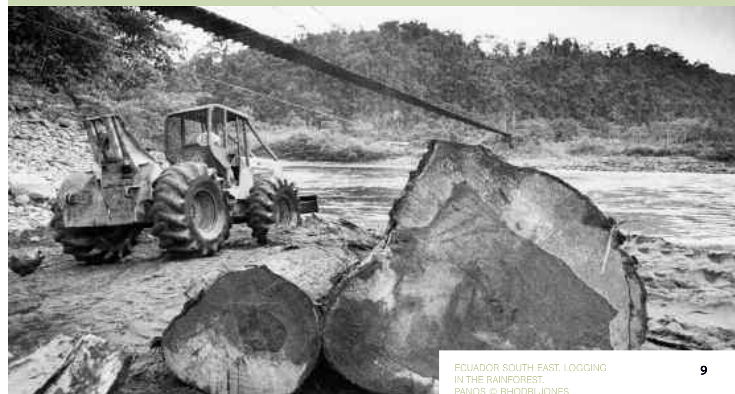
EQUADOR SOUTH EAST. LOGGING IN THE RAINFOREST.

We also wanted to capitalise on our achievement in getting the border closed 2006, one of the few times that external pressure of this kind has actually forced a tangible change in Chinese Government practice. Some success can be seen in developments within the Chinese Government in 2007: the Ministry of Commerce commissioned a study of China's global impact, including the timber industry, and in August authorities announced the publication of guidelines for enterprises engaging in logging overseas. With a view to both our work in Burma and other parts of the world, it is imperative that we continue this pressure and learn more about how we can influence Chinese global policy on natural resources in the future.