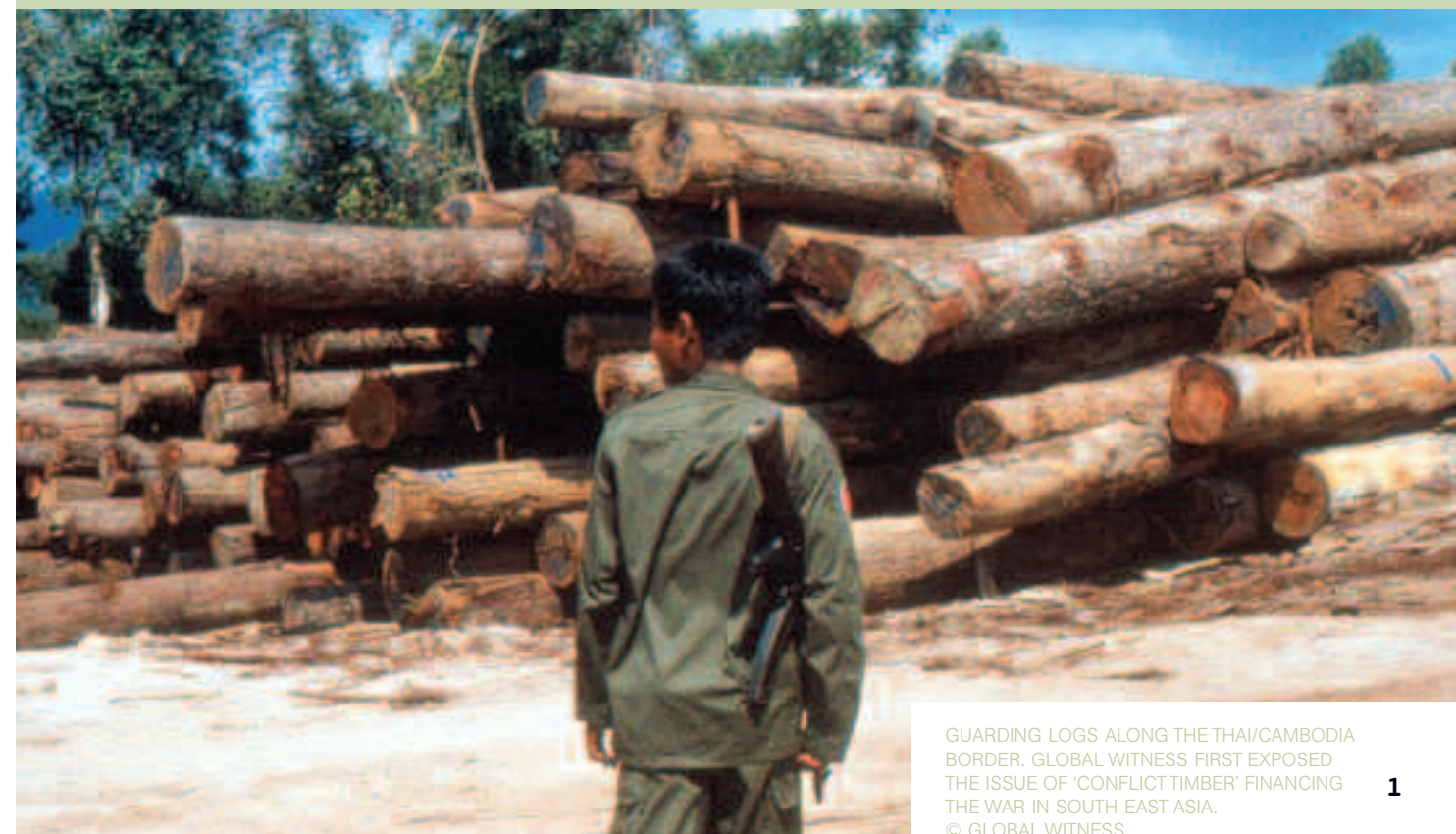
GUARDING LOGS ALONG THE THAI/CAMBODIA BORDER. GLOBAL WITNESS FIRST EXPOSED THE ISSUE OF 'CONFLICT TIMBER' FINANCING THE WAR IN SOUTH EAST ASIA.

• Global Witness' investigations led to precedent-setting United Nations sanctions on exports of Liberian timber during the civil war, cutting off Charles Taylor's main source of funding.