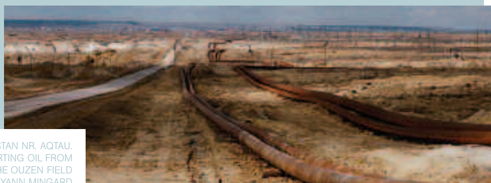
KAZAKHSTAN NR. AQTAU. PIPELINES TRANSPORTING OIL FROM THE OUZEN FIELD

The case was an important victory for the right of Congolese citizens to know how government officials are managing public money, and represents a victory for free speech by organisations and individuals investigating corruption.