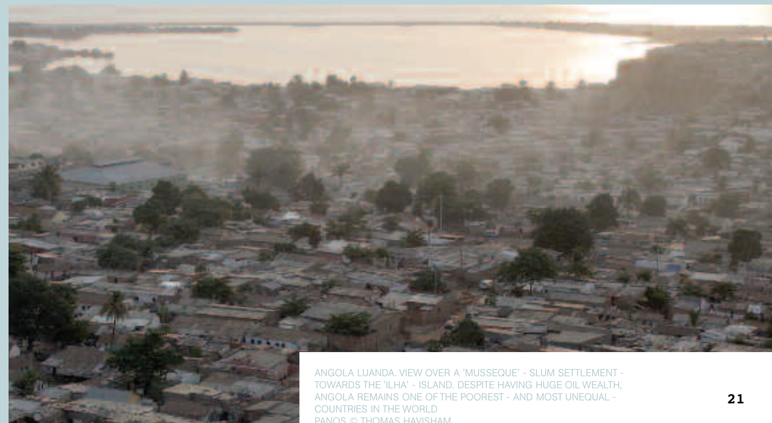
ANGOLA LUANDA. VIEW OVER A 'MUSSEQUE' - SLUM SETTLEMENT - TOWARDS THE 'ILHA' - ISLAND. DESPITE HAVING HUGE OIL WEALTH, ANGOLA REMAINS ONE OF THE POOREST - AND MOST UNEQUAL - COUNTRIES IN THE WORLD

However, we don't think anyone has done enough to tackle the root causes of the problem and to prevent promulgation of this failed industrial logging model by the international development institutions. We will seek to demonstrate convincingly how benefits of industrial scale timber extraction, especially in areas of poor governance, are relatively low and how the costs are potentially much larger. We intend to use this to open up new approaches for international conservation. Put simply: the international community should, in their own enlightened interest, pay forest-rich but poor countries to keep those forests standing. The torrent of money that is chasing climate change mitigation under the Kyoto Protocol and other initiatives to tackle climate change could be put to good use here. At the moment, it appears much of that money will be wasted and misdirected or hijacked by the logging community to reward companies simply for obeying the law.