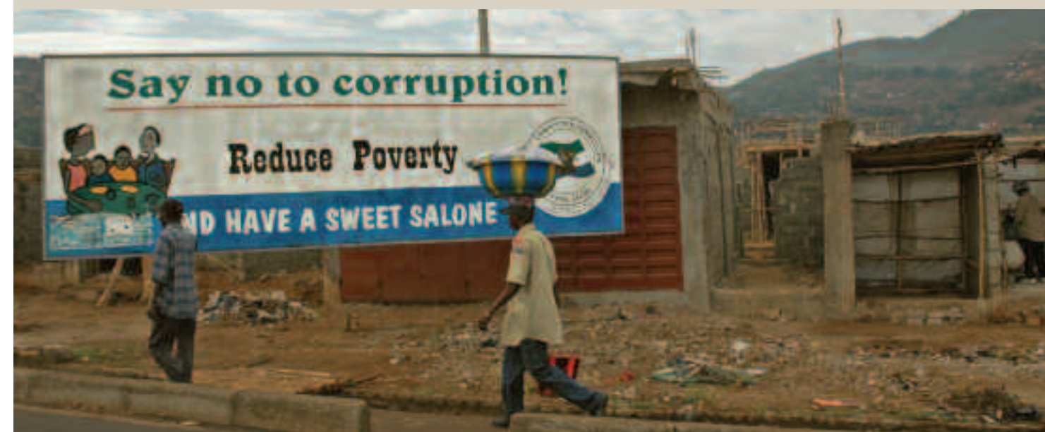
SIERRA LEONE FREETOWN. 'SAY NO TO CORRUPTION - REDUCE POVERTY' - POSTER ON THE ROADSIDE. GLOBAL WITNESS' WORK AIMS TO MAKE A REAL IMPACT ON REDUCING CORRUPTION.