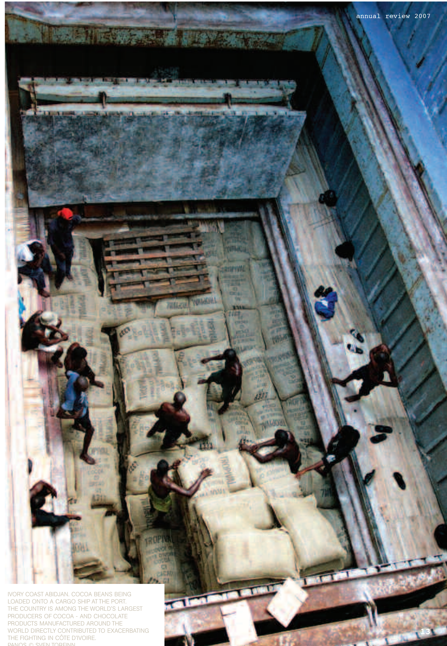
IVORY COAST ABIDJAN. COCOA BEANS BEING LOADED ONTO A CARGO SHIP AT THE PORT. THE COUNTRY IS AMONG THE WORLD'S LARGEST PRODUCERS OF COCOA - AND CHOCOLATE PRODUCTS MANUFACTURED AROUND THE WORLD DIRECTLY CONTRIBUTED TO EXACERBATING THE FIGHTING IN CÔTE D'IVOIRE.

This year, our lobbying of Mittal and advice to the newly elected Government of Liberia, which inherited the bad deal, helped prompt a renegotiation of the contract. The amended contract, which has been almost completely re-written, addresses