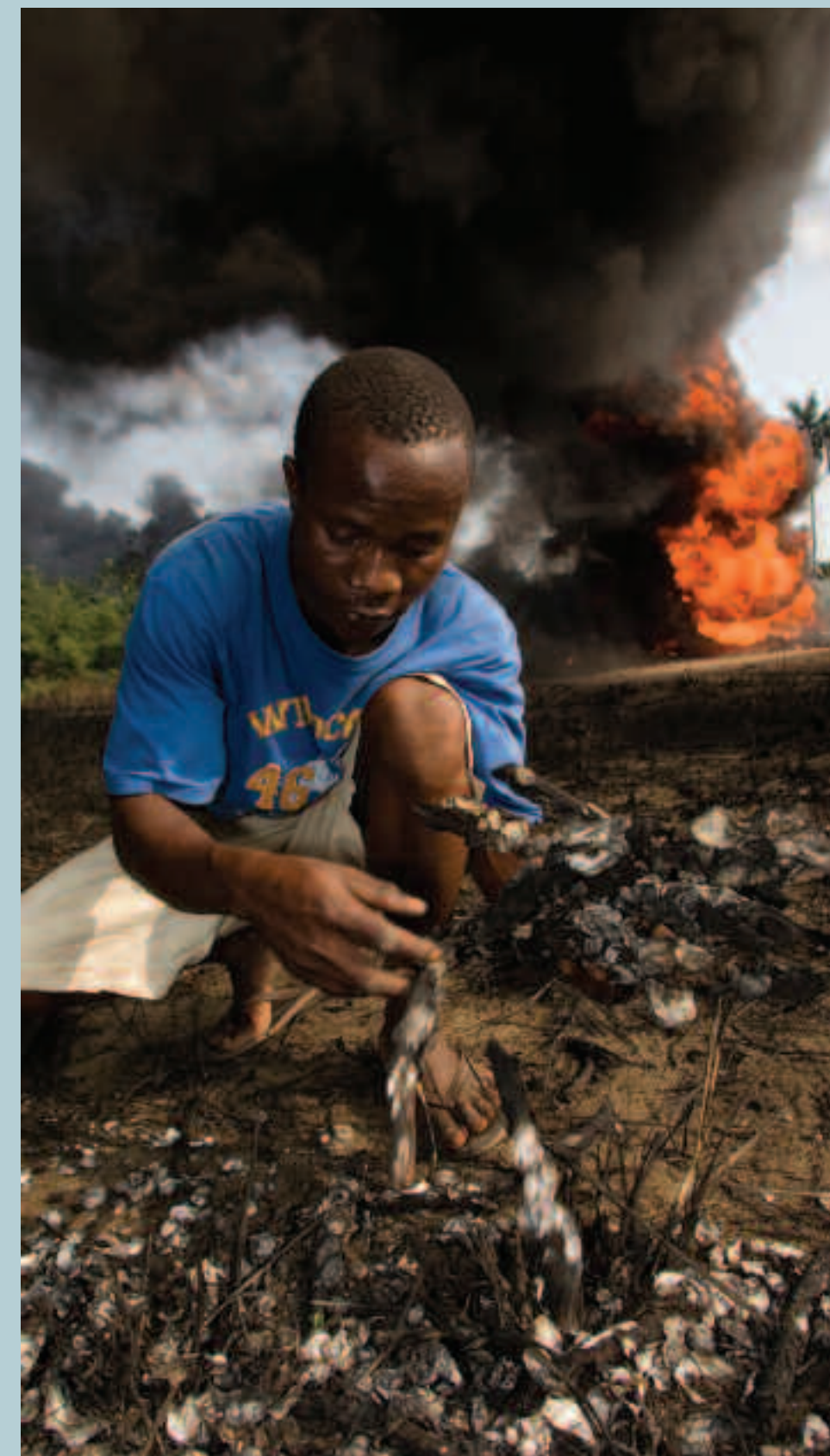
NIGERIA NIGER DELTA. A MAN SORTS THROUGH PIECES OF BURNT WOOD AS A FIRE FROM AN OIL PIPELINE BURNS BEHIND. REVENUES FROM OIL EXTRACTION WORLDWIDE SHOULD BE PLOUGHED BACK INTO SUSTAINABLE DEVELOPMENT AND POVERTY ALLEVIATION, RATHER THAN LOST TO MISMANAGEMENT AND CORRUPTION.