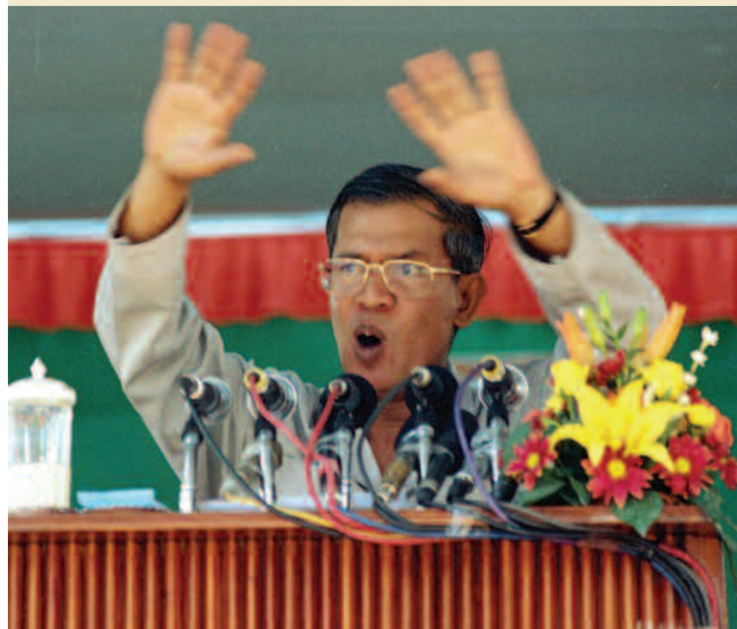
CAMBODIAN PRESIDENT HUN SEN. GLOBAL WITNESS BELIEVES WE HAVE PROVEN HOW HIS RELATIVES CONTROL THE COUNTRY'S MOST POWERFUL LOGGING SYNDICATE, ACCUSED OF CORRUPTION, ILLEGAL LOGGING ACTIVITIES AND THE ATTEMPTED MURDER OF COMMUNITY FOREST ACTIVISTS. HUN SEN IS IMPLICATED AS COMPLICIT IN THESE ACTIVITIES IN OUR REPORT CAMBODIA'S FAMILY TREES.

Global Witness is now reaching out to the international legal community to explore ways to end impunity for the perpetrators of massive corruption.