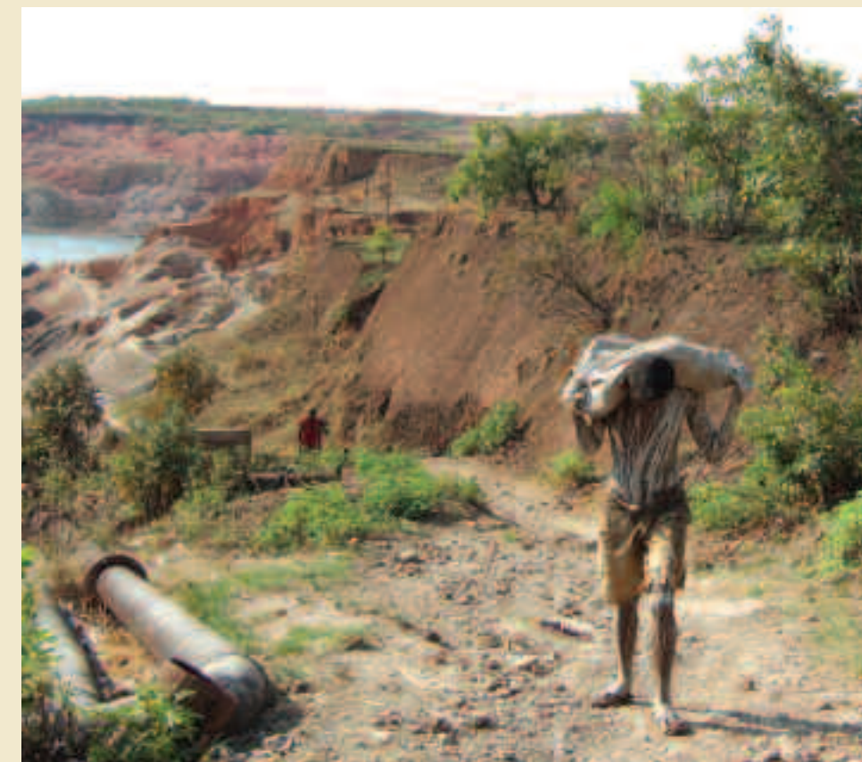
YOUNG MAN CARRYING SACK OF MINERALS, RUASHI MINE, KATANGA. THE DRC'S MINERAL WEALTH HAS THE POTENTIAL TO MAKE A REAL CONTRIBUTION TO HELP LIFT THE COUNTRY OUT OF POVERTY, IF PROPERLY MANAGED.

2007 saw an increase in our campaigning on DRC's forests. We focused on the risks of uncontrolled industrial-scale logging, the threats to the rights of local communities and the weakness of government control of the sector. Sustained advocacy towards the World Bank and donor governments led to heightened international awareness of these problems and pledges by several donors to provide assistance to the DRC in protecting and managing its forests.