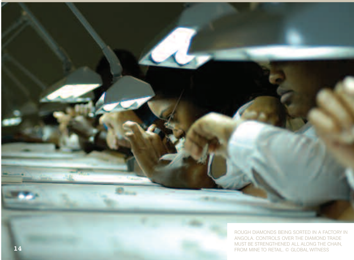
ROUGH DIAMONDS BEING SORTED IN A FACTORY IN ANGOLA. CONTROLS OVER THE DIAMOND TRADE MUST BE STRENGTHENED ALL ALONG THE CHAIN, FROM MINE TO RETAIL.