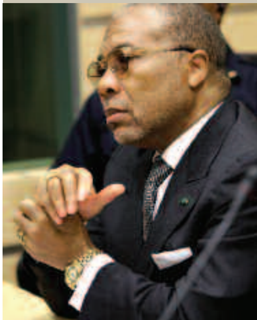
FORMER LIBERIAN PRESIDENT CHARLES TAYLOR IS SEEN IN COURT AS HIS TRIAL REOPENED AT THE U.N.-BACKED SPECIAL COURT FOR SIERRA LEONE. THE HAGUE, NETHERLANDS