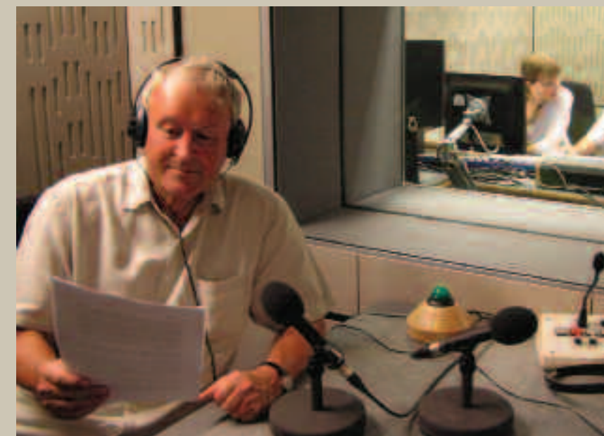
RENOWNED BROADCASTER JULIAN PETTIFER RECORDS THE BBC RADIO 4 APPEAL FOR GLOBAL WITNESS

We have the opportunity to engage in a variety of debates that could, with our and other NGOs' help, shape the sustainability and fairness with which the world manages its natural resources. For example, as the deforestation caused by industrial-scale logging is increasingly questioned in a world more aware of the threats of climate change, we need to push for the rights of forest communities and the importance of preserving forest cover and prioritising other wealth-earning uses of the forests, as part of the global fight to reduce climate change.