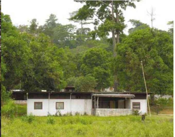
Former Lamco house in Yekepa