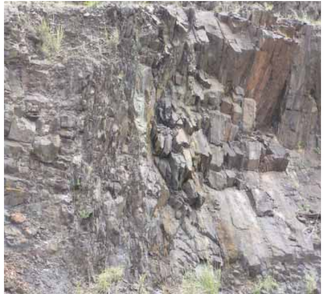
Valuable asset: iron ore, Yekepa,

Section 2: In the event that the CONCESSIONAIRE would build facilities to process iron Ore into higher added value products including but not limited to pellets, DRI and HBI, a lower rate of royalty shall be negotiated between the Parties prior to the commencement to the development of the necessary production facilities.”