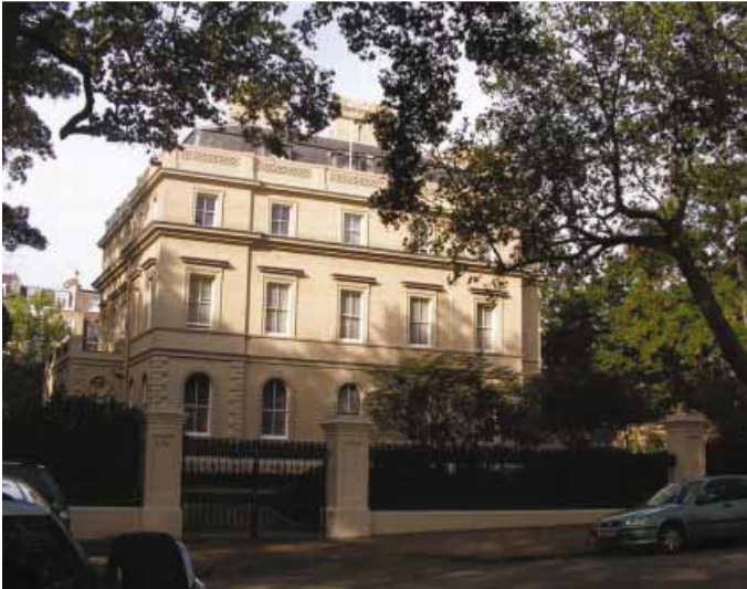
Lakshmi Mittal's house in London